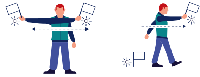
Horizontal waving of white flag, light or flare. Putting one flag, light or flare on ground and moving off with a second indicates direction of safer landing.

Additional signals mean safer landing in direction indicated.