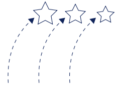
Three white star signals or three light and sound rockets fired at approximately 1 minute intervals.